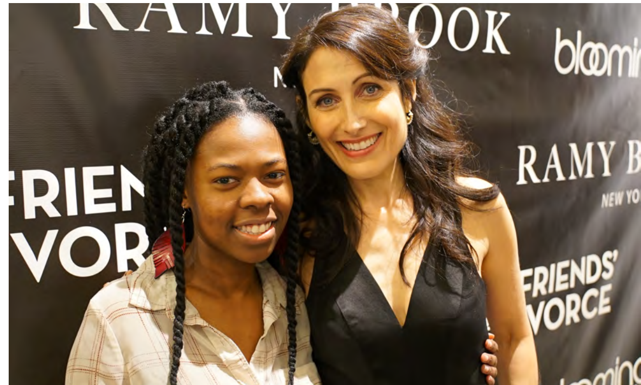
LISA EDELSTEIN FROM GIRLFRIEND'S GUIDE TO DIVORCE