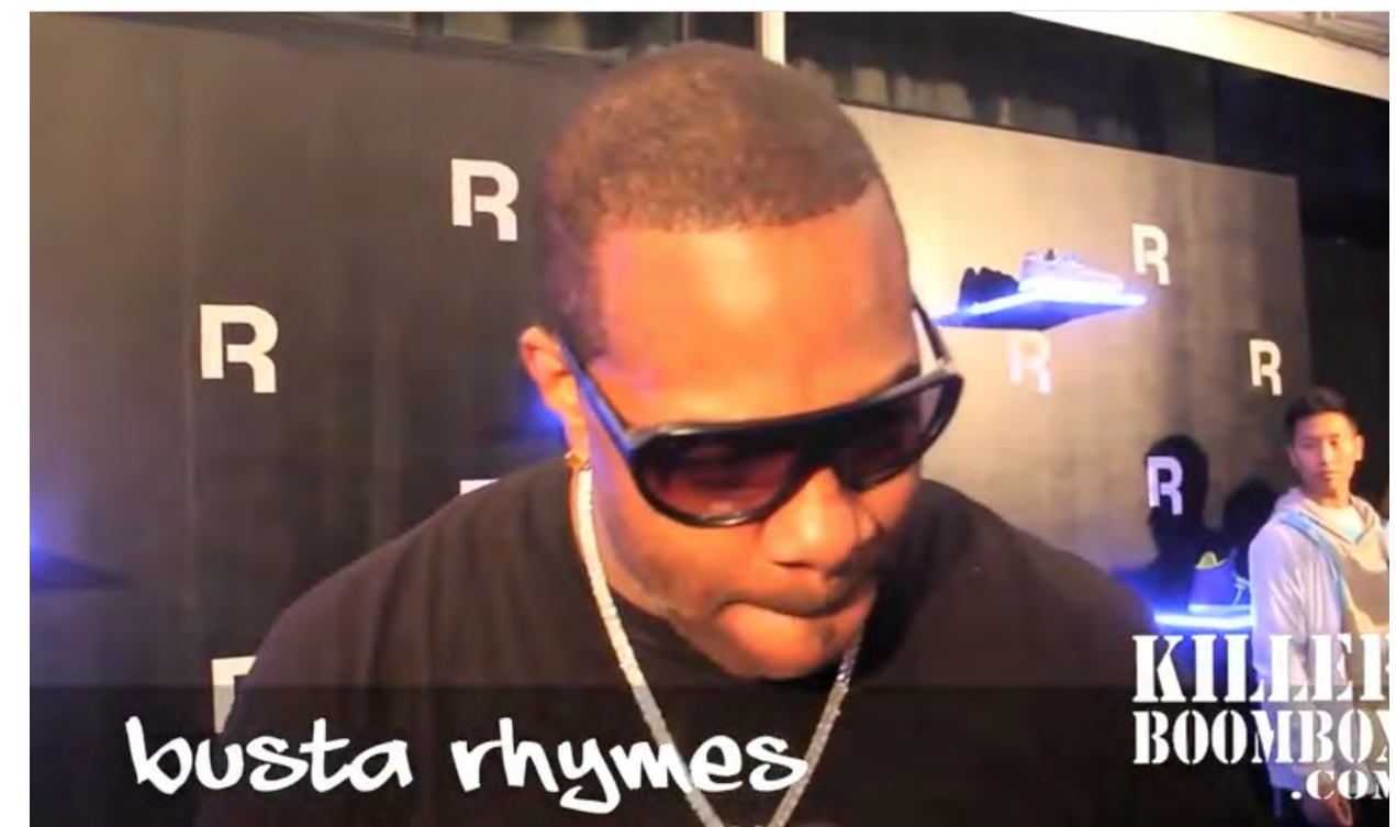
NYC REEBOK EVENT X BUSTA RHYMES